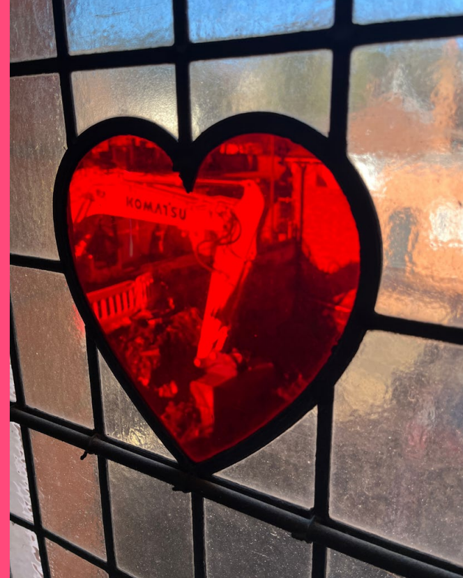
Heart shaped window: A window that is remaining as part of our listed building status. Through a window of the past we can see what is happening in the present to serve God in the future.

Having been 'matched' happily with the appointment, I can say it is a joy to be a spiritual guide to such an exciting project. A project that would have been impossible without good relationships with the traders through the 'town team', or without good relationships with the council – where our members are respected and trusted for their commitment to the project, their professionalism and their heartfelt views - that this project is for the community, not for the church members.