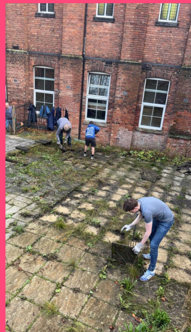
Volunteers of all ages lifting paving slabs to clear the ground

When the work is completed, we will indeed have a refurbished church building for worship. We will also be able to host events for up to 350 people; we will have meeting rooms of differing sizes for corporate, community or church activities and we will have our Cornerstone coffee shop with its fabulous cakes! All of the rooms will be completely accessible; we will have 7 rooms of hostel accommodation with a community kitchen and lounge facilities, plus 2 apartments to provide reasonably priced accommodation in a tourist hotspot. We will also have a community garden including the brook at the rear of our premises.