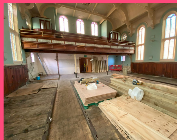
Worship space floor progressing January 2025