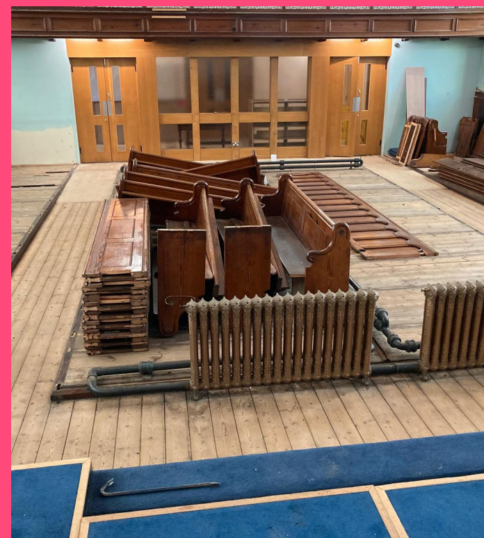
Pews being dismantled in October 2024